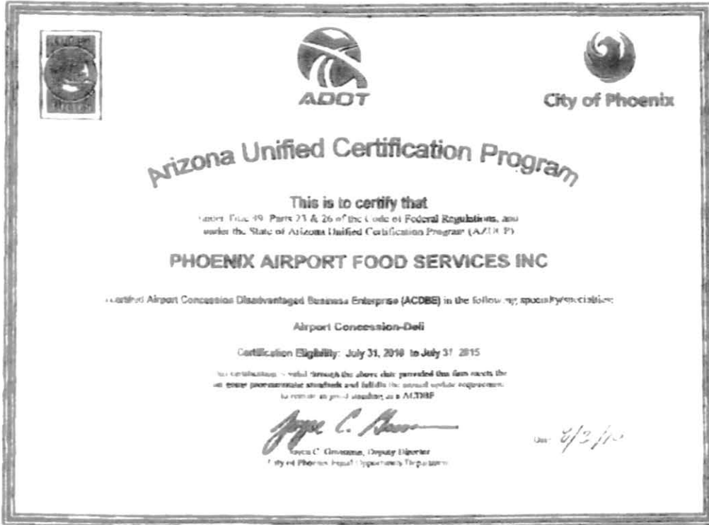
EXHIBIT "E" TO SUBLEASE ACDBE CERTIFICATE